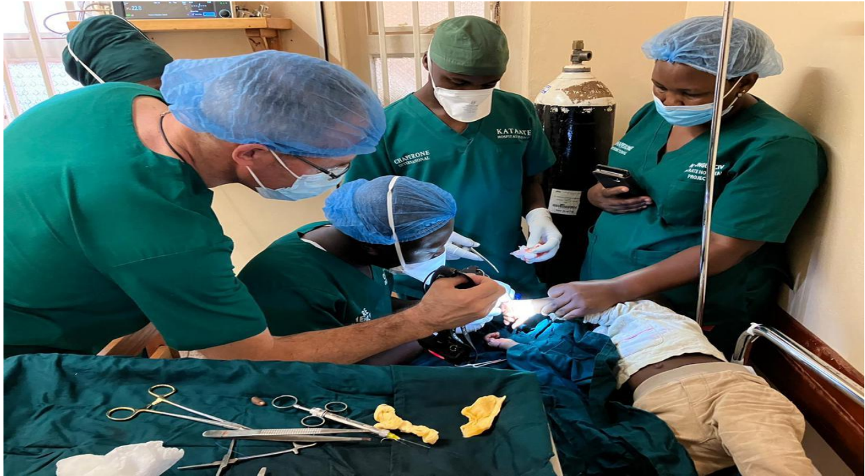
Dedication, Commitment to deliver services beyond self