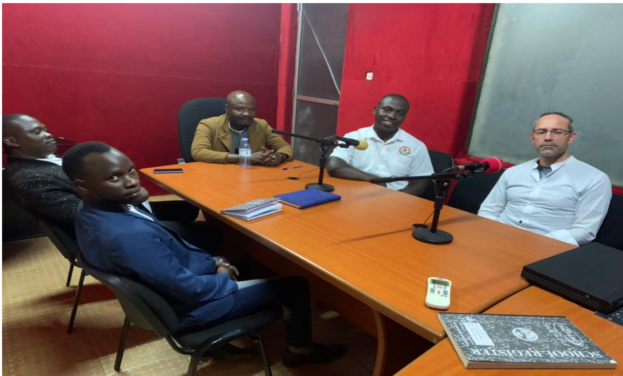
Community Mobilisation: Radio talkshow on KBS Radio.