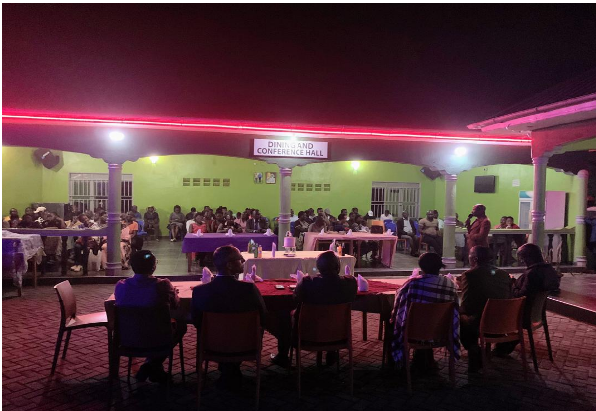
Staff party at Farmers' Lounge at the end of the medical camp.