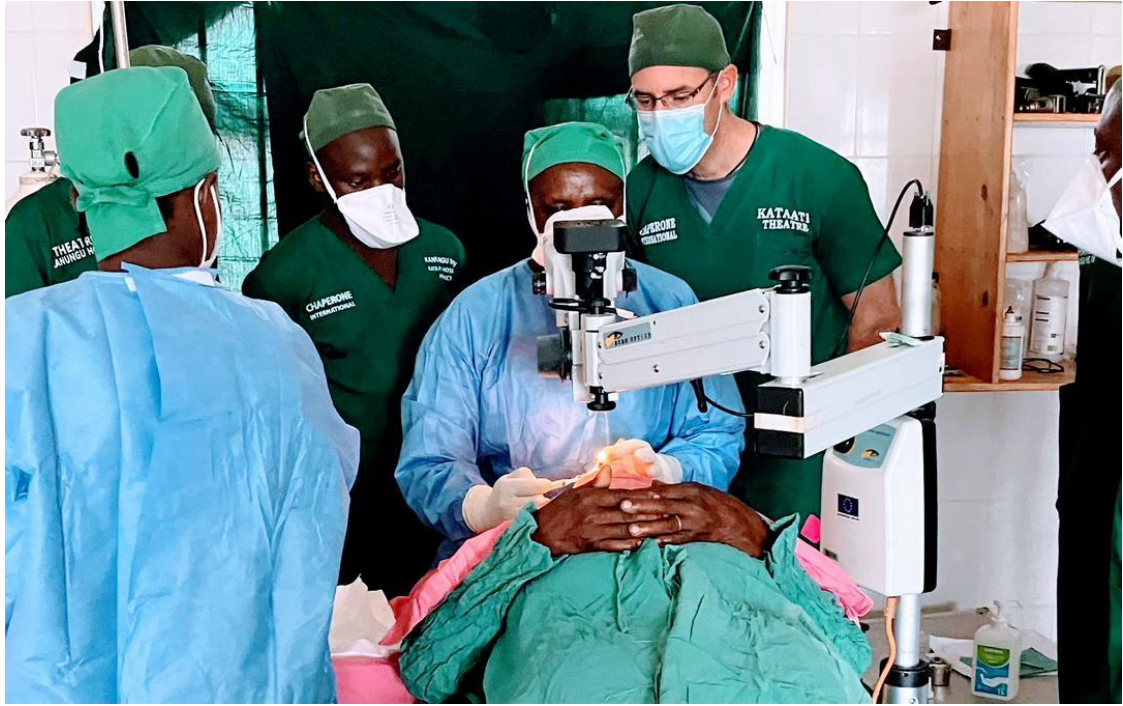
Expertise meets passion: we love what we do for our patients.