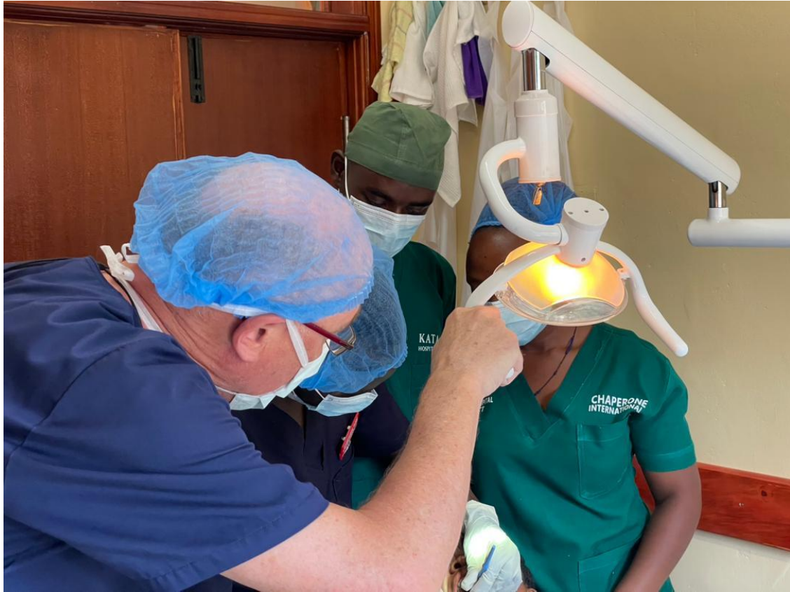
Mentorship for junior staff/ skills transfer