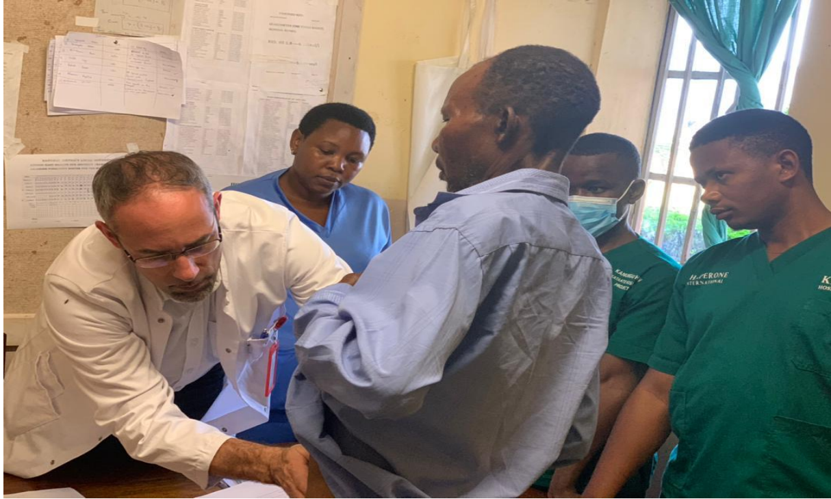
Prior assessments by surgeon.