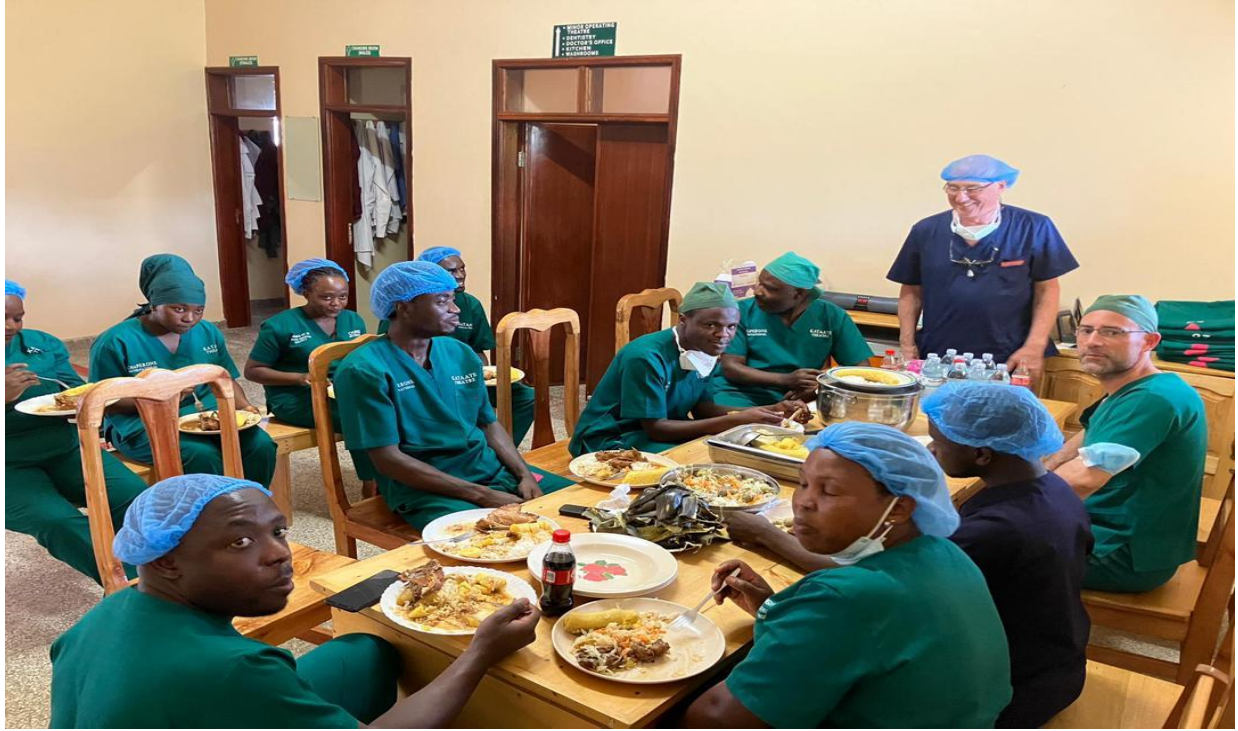
Meal time: Staff in theatre share lunch.