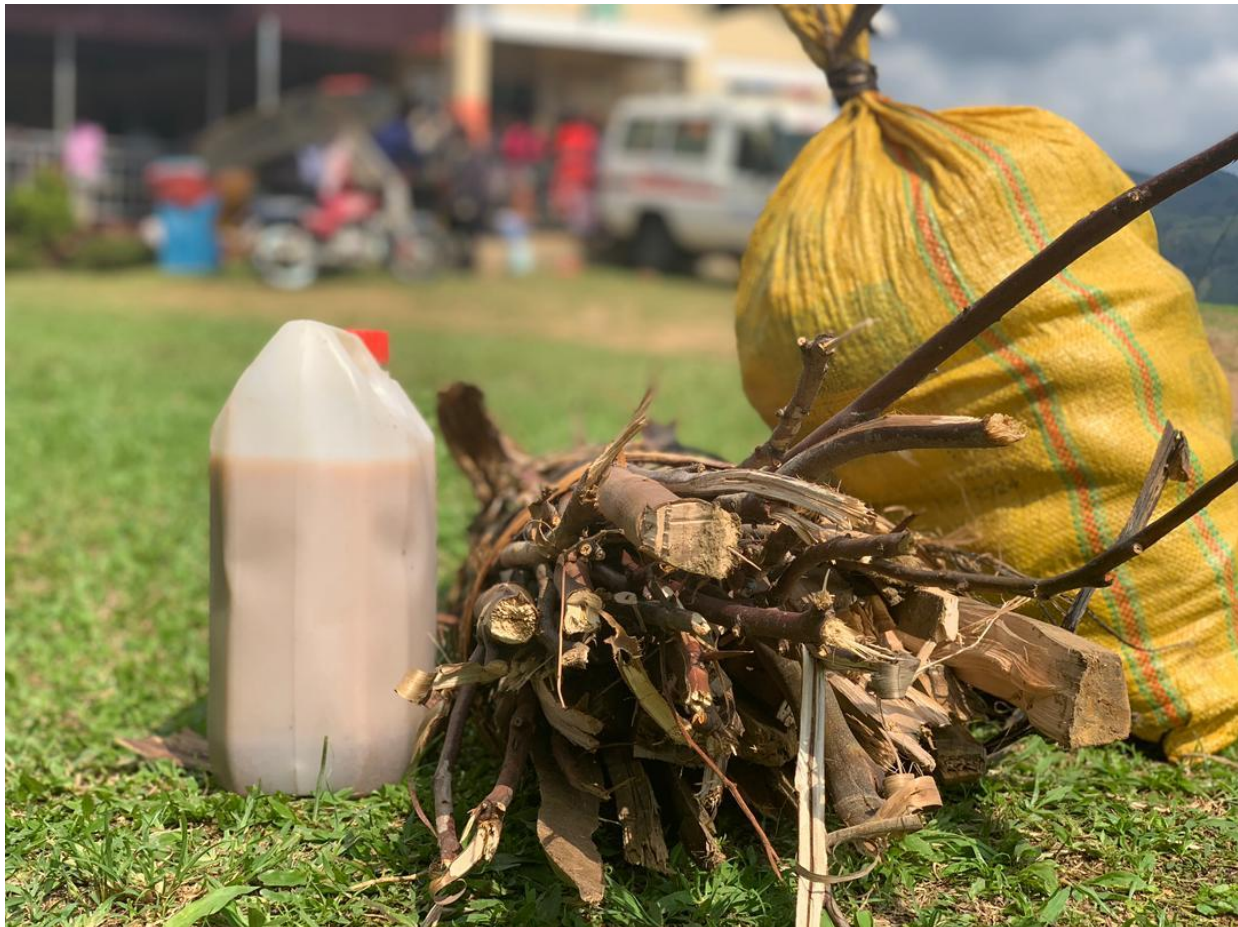
Medical camps provide specialized medical care to some of the poorest of the poor.

Uganda's healthcare faces an acute shortage of health workers, doctors severely so, with only one doctor for every 8,300 Ugandans. The fact that 70% of the doctors practice in the big towns, yet 80% of Uganda's population lives in rural areas, some remote, complicates the situation estimated for one doctor for every 22,000 people. Kanungu District typically falls in this class of medically- deprived populations of Sub-Saharan Africa. Difficult hilly terrain and the absence of many social amenities in areas such as Kanungu District, combined with lack of essential facilities and drugs, affect morale of health workers. Many people of rural areas of Uganda lack access to basic healthcare services, such as consulting with a doctor, essential laboratory tests and awareness of diseases they are suffering from. COVID-19 lockdown restrictions for travel in recent years exasperated this challenge, doubly for the poorest in the communities who cannot afford ambulance services and the cost of finding quality healthcare in private urban hospitals.