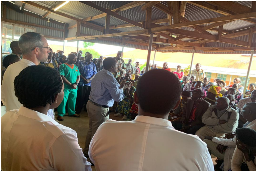
Sensitisation: health education and health promotion.